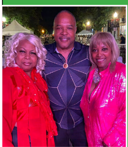
Blues Fest 2022 in Old