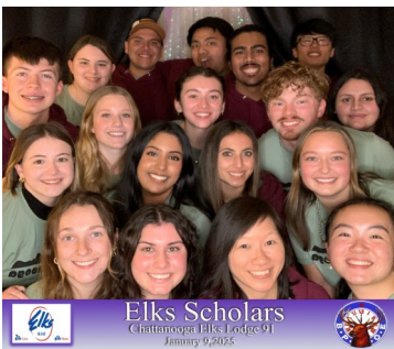
Elks Scholars Chattanooga Elks Lodge #91 January 9, 2025

After three days of community service in the Chattanooga area, 28 ENF Scholars visit our Lodge for an evening of fun. The Scholars spent their days in Chattanooga helping various community organizations including Chattanooga Food Bank, Chattanooga Community Kitchen and Chambliss Center for Children. Our Lodge provided dinner sponsored by El Mason, games and live music provided by The Bob. Our members had a great time interacting with the Scholars. Congratulations all Scholars and a big thank you to their Coordinators. They did get to spend an extra day in Chattanooga due to the snow.