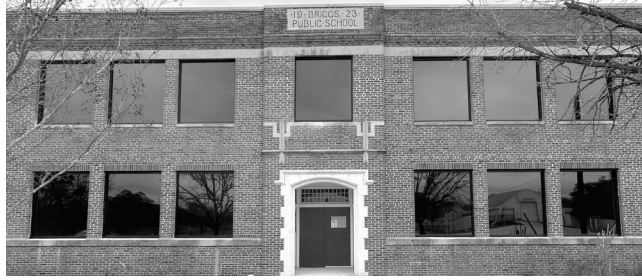
New windows on the school building!

1200 copies published & mailed in the area by Briggs Community Center Inc. PO Box 143 Briggs, TX 78608