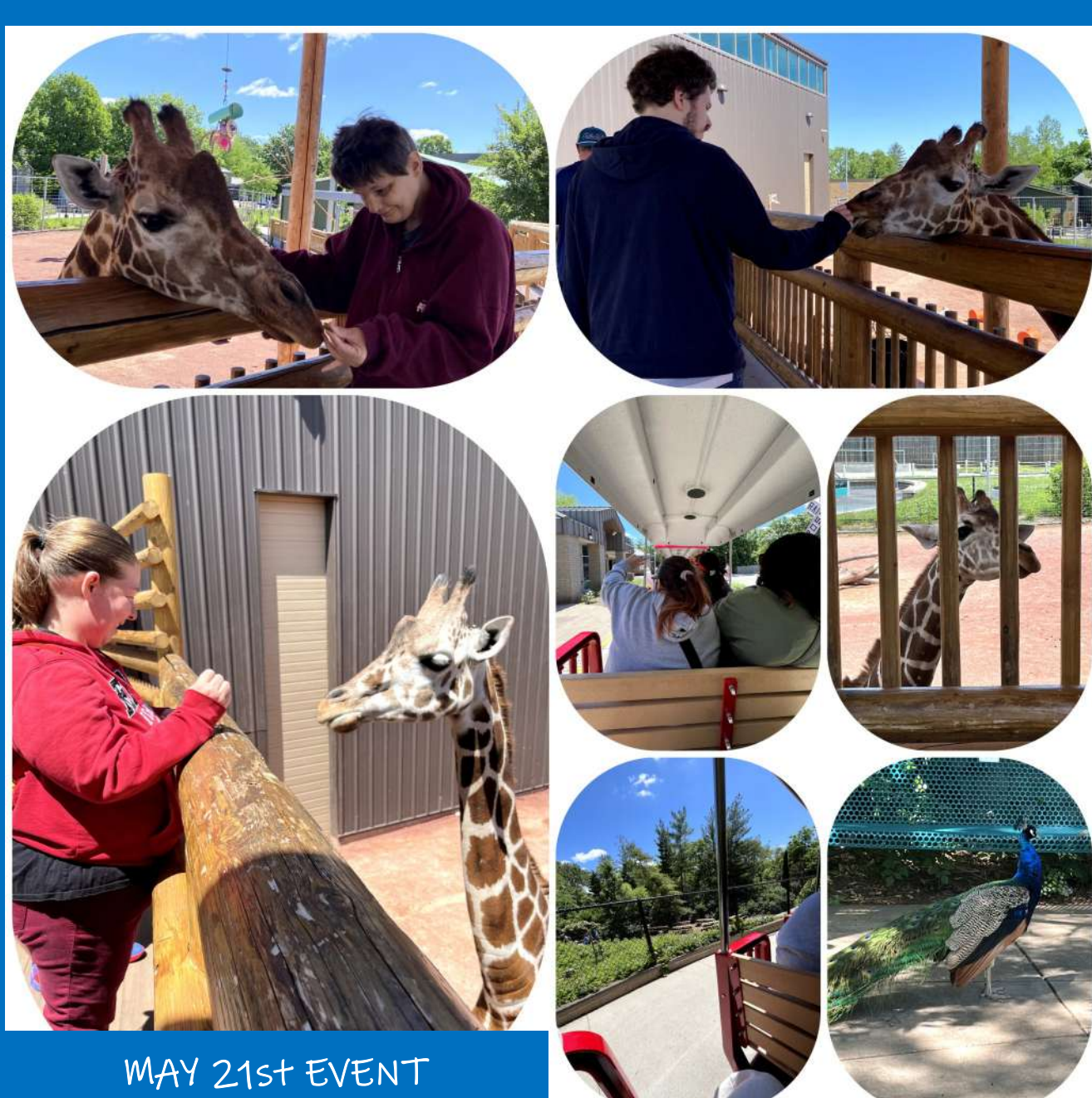
MAY 21st EVENT LINCOLN ZOO