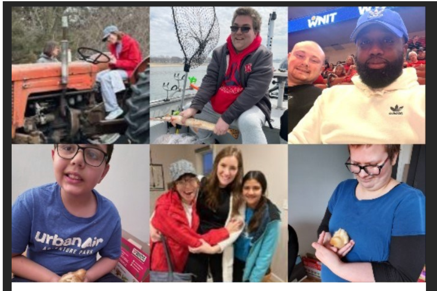
SHARE PHOTOS ENTER A DRAWING WIN A GIFT CARD