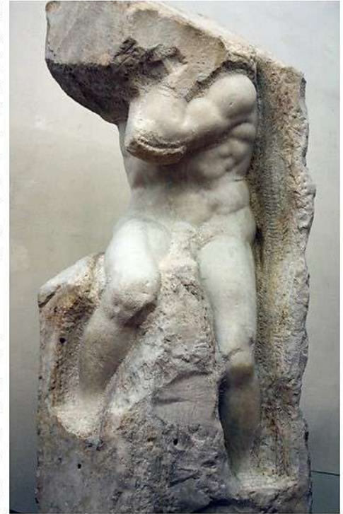
"The Atlas" by Michelangelo

This vision and tool are precisely what God employed to bring his children into eternal fellowship. As students of Jesus, we are to follow our teacher and be imitators of him. Often times what it takes to wield this unique tool of the Christian faith is the ability to imagine. We imagine what it must be like to be in the shoes of another and give them the benefit of the doubt, we imagine what could be the root cause driving someone to treat us poorly and with compassion we return a blessing, we imagine that future state of universal peace and joy we are heading towards when the afflictions of this world lay heavy on us.