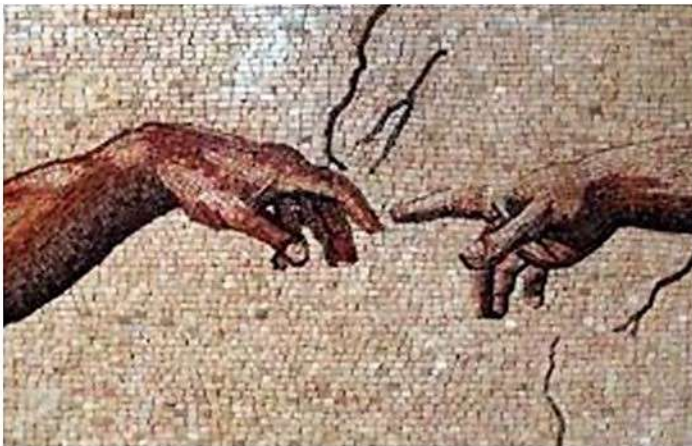
Mosaic of "The Creation of Adam" by Michelangelo

But the one who overcame the world remained faithful to the vision and displayed the discipline to love those who would execute him with mercy, saying, "Father forgive them, they know not what they do." To this day Jesus remains hard at work chiseling away at the hardened hearts of his followers and those who have yet to come into his fold until one day fully revealing that glory that is ours through him. For now, we see dimly the glory but soon we will see him face to face.