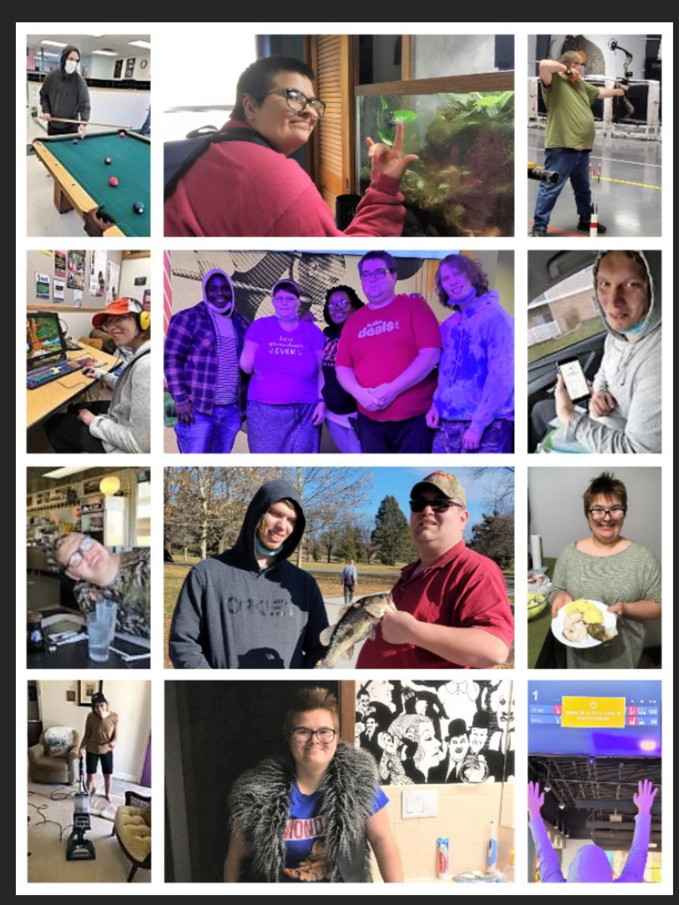
Be Confident. Learn Skills . Have Fun.