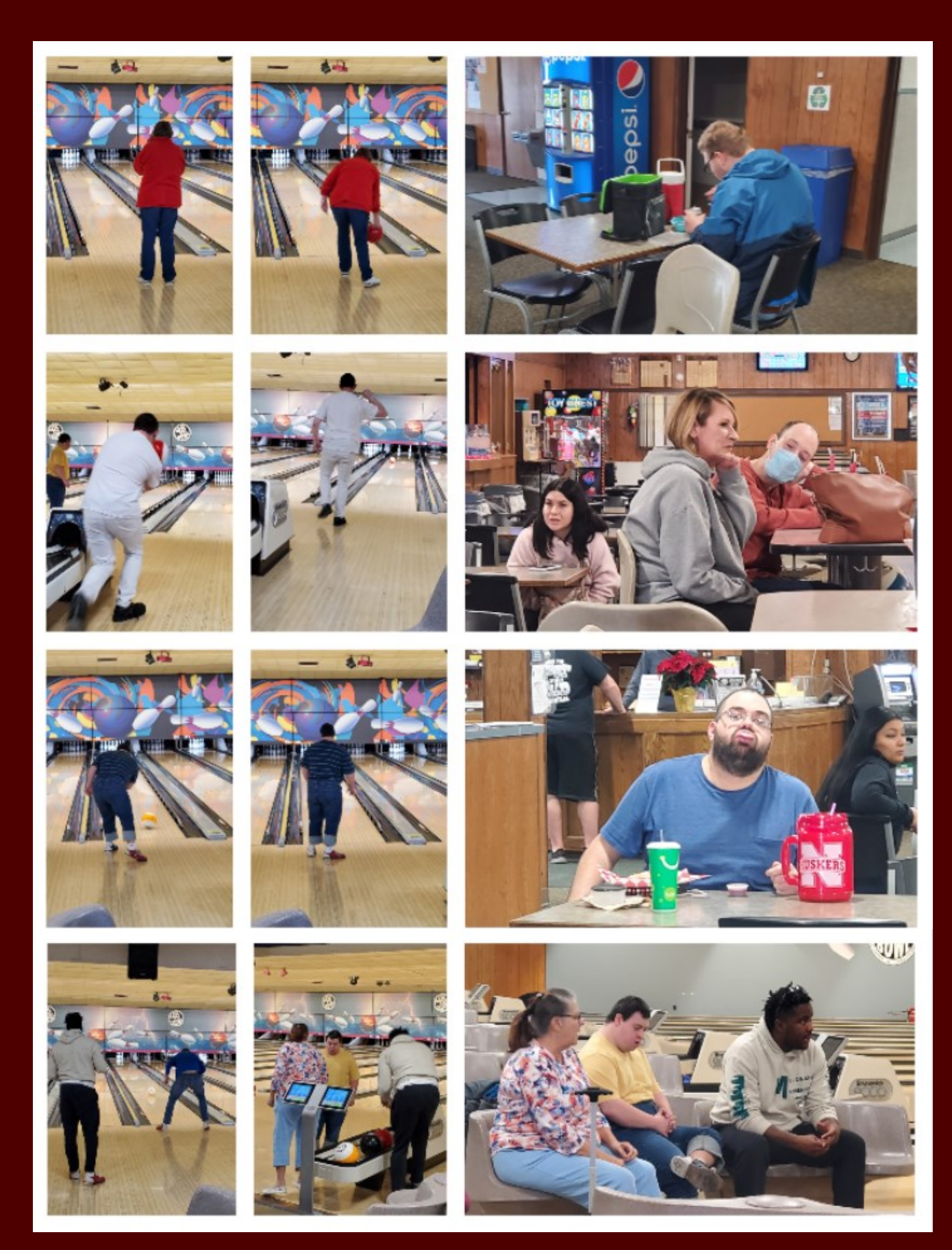
Be Confident. Learn Skills . Have Fun.