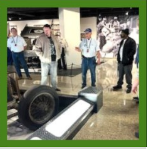
↑↑ Museum Tour At Speedway Motors