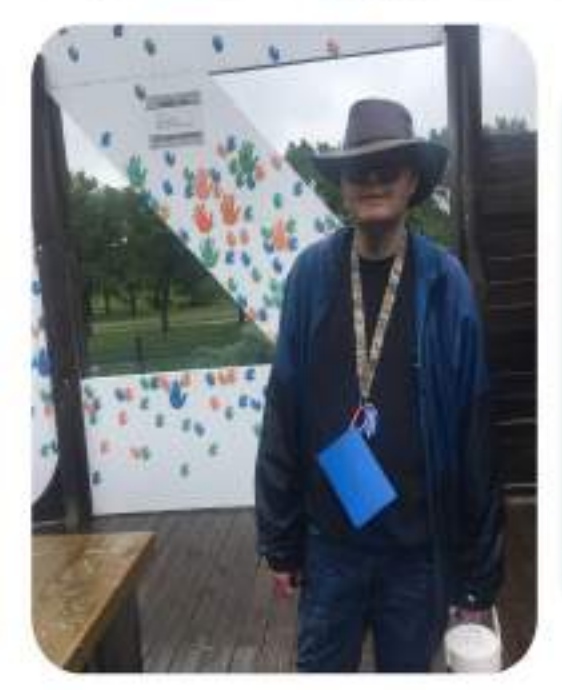
May 25th Abled Event at the Lincoln zoo