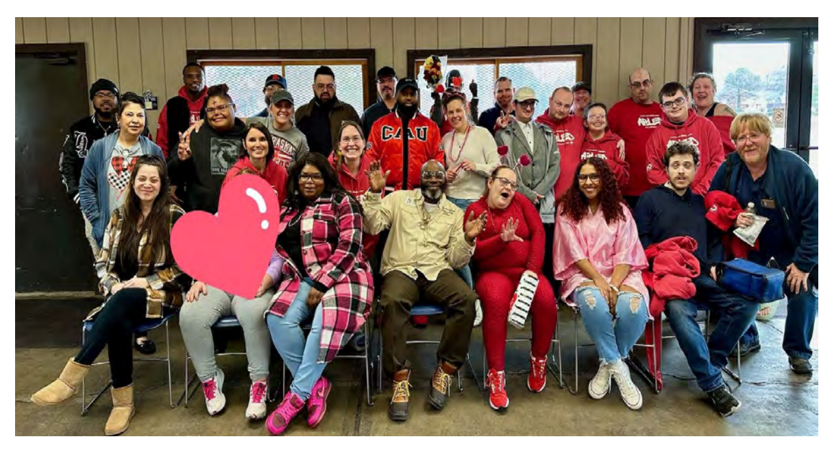
CELEBRATING OUR 10 YEAR ANNIVERSARY FEB 14