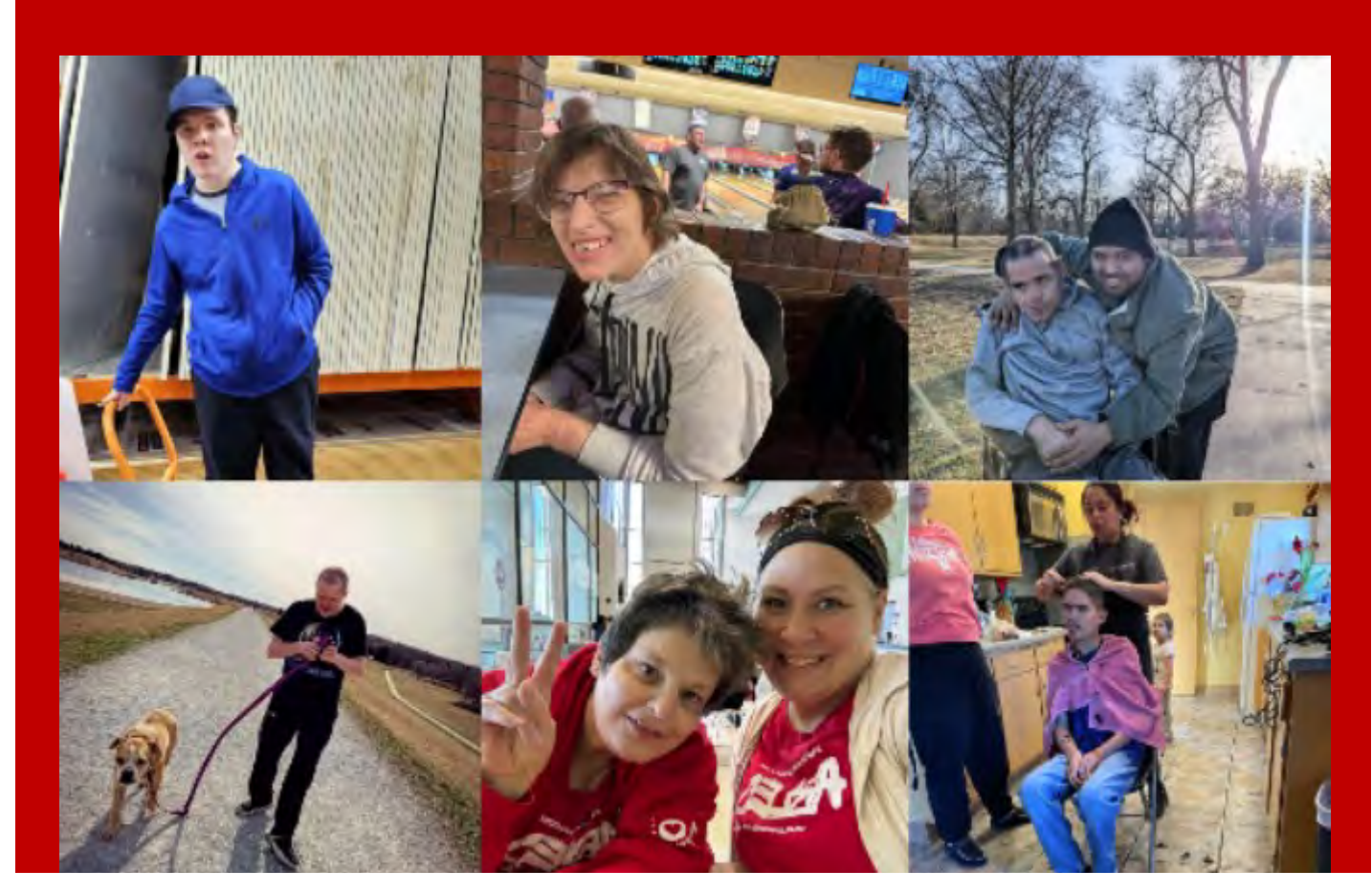
SHARE PHOTOS TO WIN GIFT CARDS FOR MORE COMMUNITY ACTIVITIES