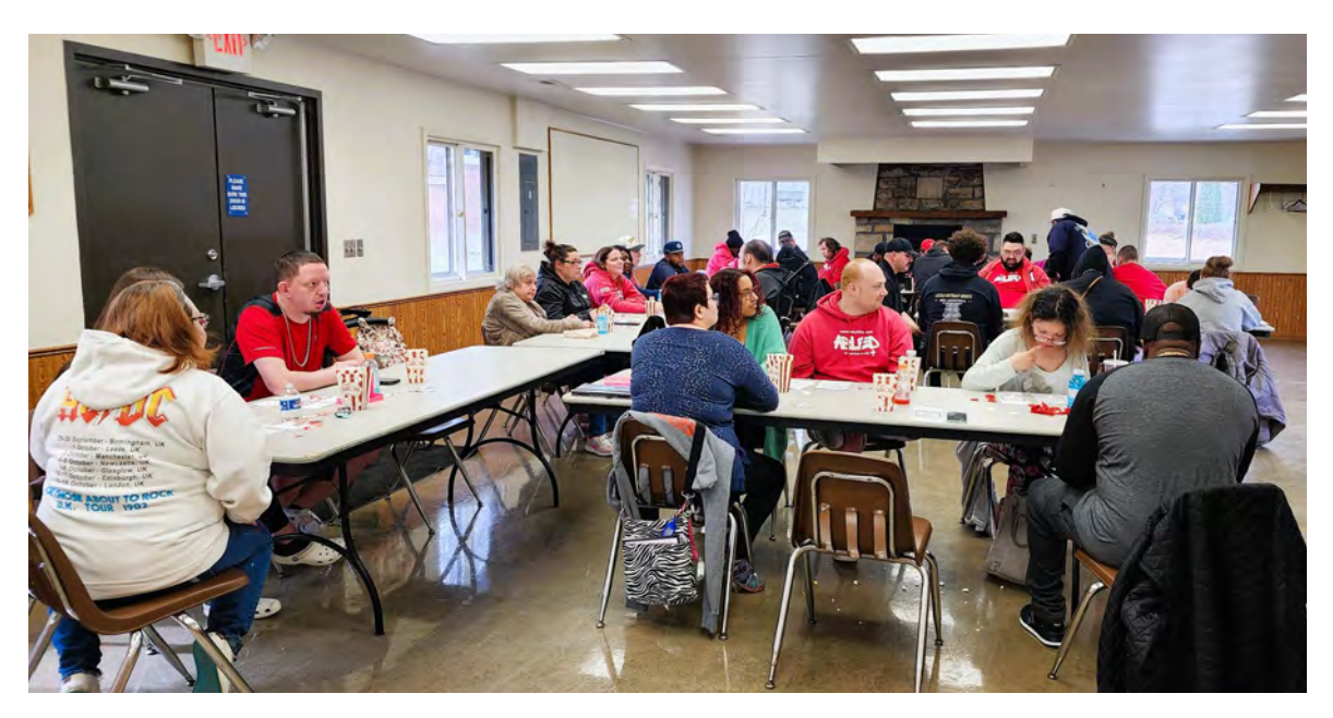
PLAYING BINGO AND WINNING PRIZES MAR 13