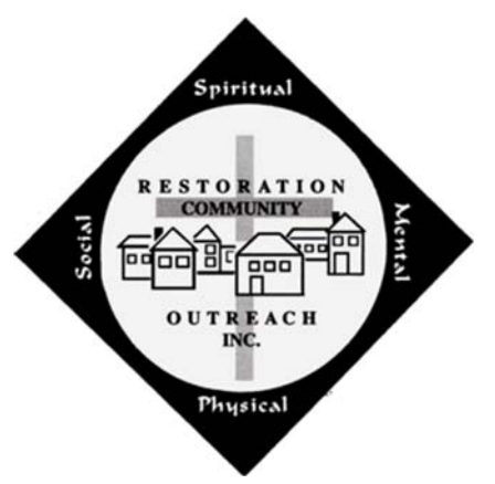
Restoration Community Outreach