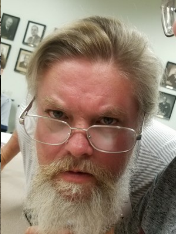
May Dinner Group