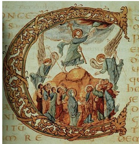
Drogo Sacramentary, c. 850

This week's texts if you want to explore further: Acts 1: 1-11; Psalm 46 (47); Ephesians 1: 17-23; Matthew 28: 16-20