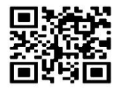
QR Code for the Parish Website

CHILDREN'S LITURGY ON SUNDAYS AT ST MICHAEL'S during 9am Mass & ST JOSEPH'S during 11 am Mass on alternate weeks.