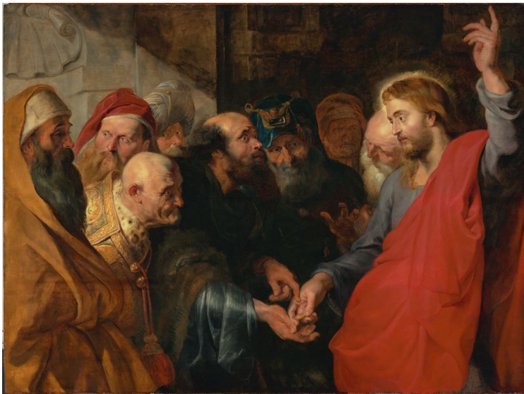
Peter Paul Rubens, The Tribute Money

If you'd like to receive Prego by email each week, sign up at www.stbeunosoutreach.wordpress.com