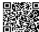
QR Code for the Donation Page

Donation to the Parish. The Link takes you to a page where you can set the amount you wish to donate and then put in your Card Details. You will then be asked if you wish to "Gift Aid" your donation. If you are a Taxpayer and wish to Gift Aid your Donation, then the Parish will be able to claim a further 25% to add to your donation.