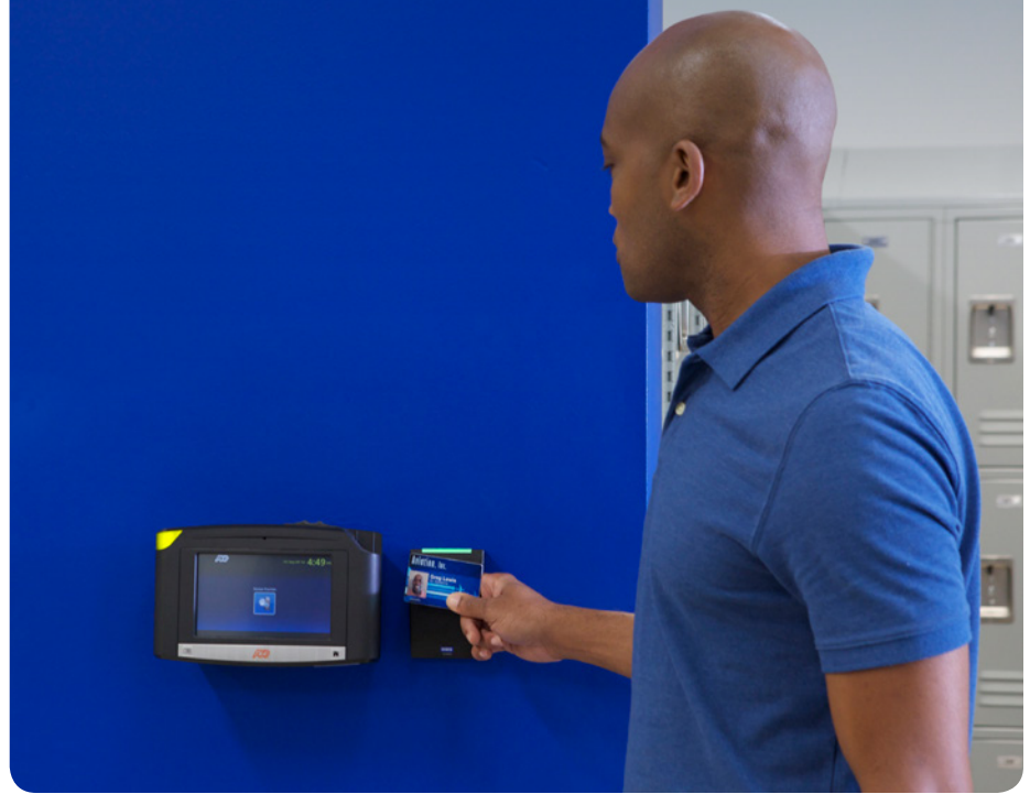
TIME AND ATTENDANCE