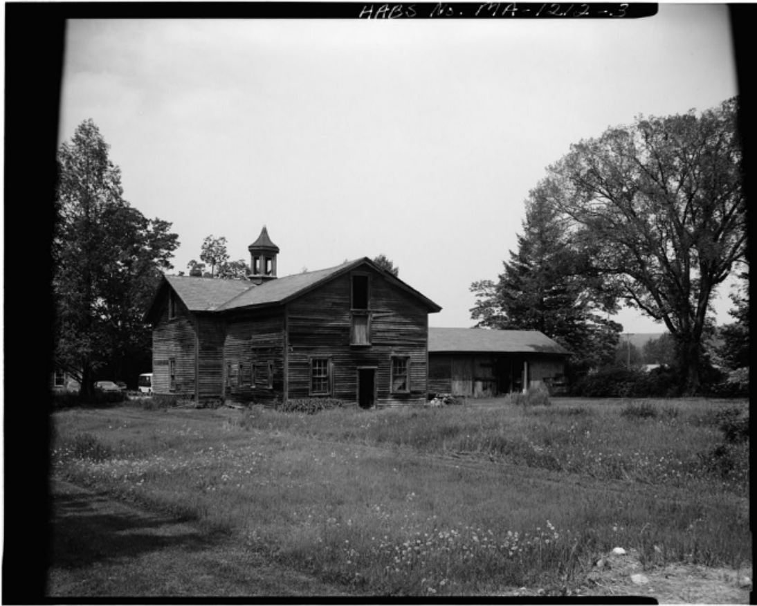
George B. Slater Carriage House HABS No. MA-1212 (Page 5)