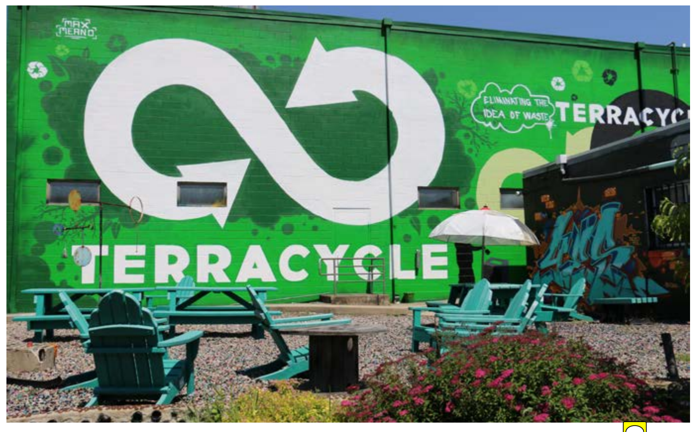
Launched in 2001 to collect and repurpose comples waste streams, TerraCycle Inc. now is focusing on promoting robbility vs. disposability.

Davos, Switzerland, the Loop project has, if nothing else, stirred a big debate about reusable packaging.