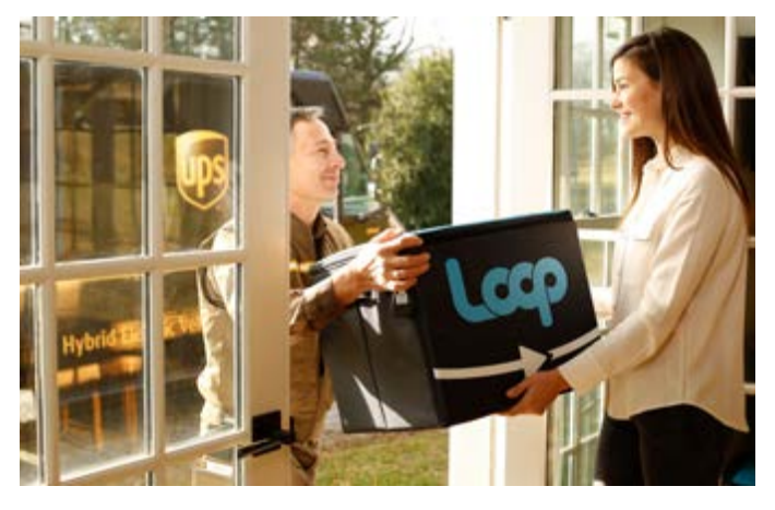
The soft, collapsible tote is the reusable package used for transporting new products to consumers, and for returning used containers to the Loop store.