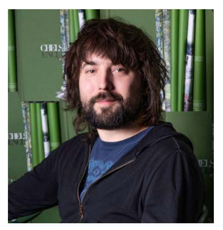
Szaky: "The real focus Loop has is in moving from single use to multi-use, from disposable to durable."

As TerraCycle notes on its website: "In nature, waste does not exist. All materials are reused or recycled through natural processes. However, modern human society and technology have created a massive waste issue. The creation of complex plastic polymers during and after the Industrial Revolution broke the closed-loop, sustainable system that had existed on Planet Earth for billions of years. Now," it notes, "the irrepressible demand for safe, conveniently packaged consumer goods is annually creating billions of tons of non-recyclable or difficult to recycle waste."