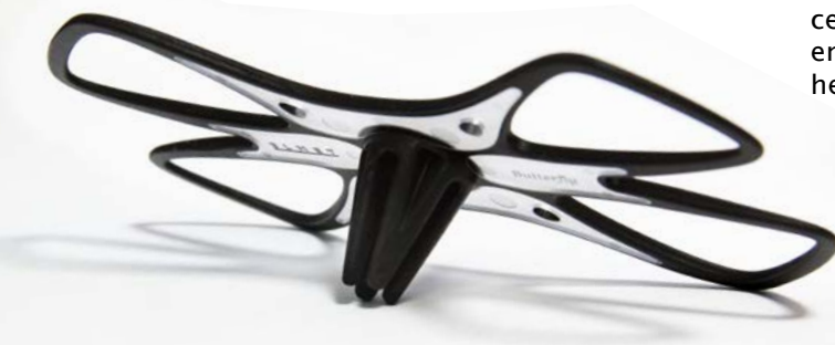
The cellphone holder's wedge-shaped, soft-touch "nose" is designed to snugly grasp the air vent grilles on nearly all current vehicle models.

Elmet—which also has offices in Taiwan, China, and Lansing, Mich.—molded the winning, two-shot part in a 40-second cycle on a Wittmann Battenfeld SmartPower Combimould 120/130H/210S injection press with a Unilog B8 control unit. Both injection units were mounted on the same machine, in a piggyback setup. Elmet equipped a Wittmann Battenfeld three-axis