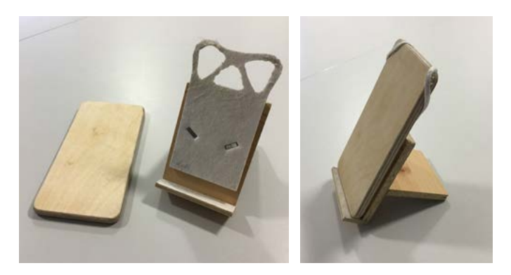
The early student mockups of possible designs included these wood and felt models.

friction and soft-touch grip, dampening characteristics, transparency and colorability, and impact resistance, as well as its ability to bond firmly to rigid thermoplastics.