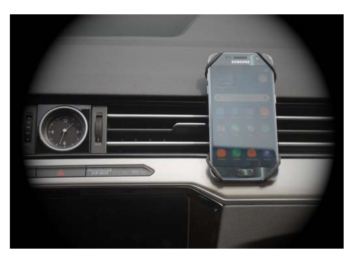
The holder allows the phone to be mounted vertically or horizontally (above). This view clearly shows how the Butterfly's "wings" grasp the corners of the phone (below).