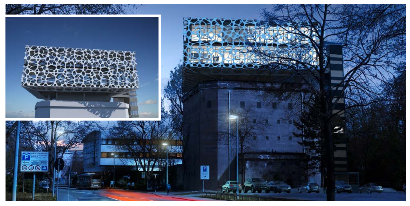
BASF's new Creation Center atop an old air-raid bunker on its campus in Ludwigshafen, Germany. The so-called "innovation factory" is designed to stimulate collaboration.

ASF SE's Performance Materials Division restructured and rebranded its product design and development efforts under what it now calls Creation Centers. The materials and chemicals giant in 2019 opened new Creation Centers in China, Japan, India, and at its headquarters in Ludwigshafen, Germany. It plans to open another such facility in Wyandotte, Mich.