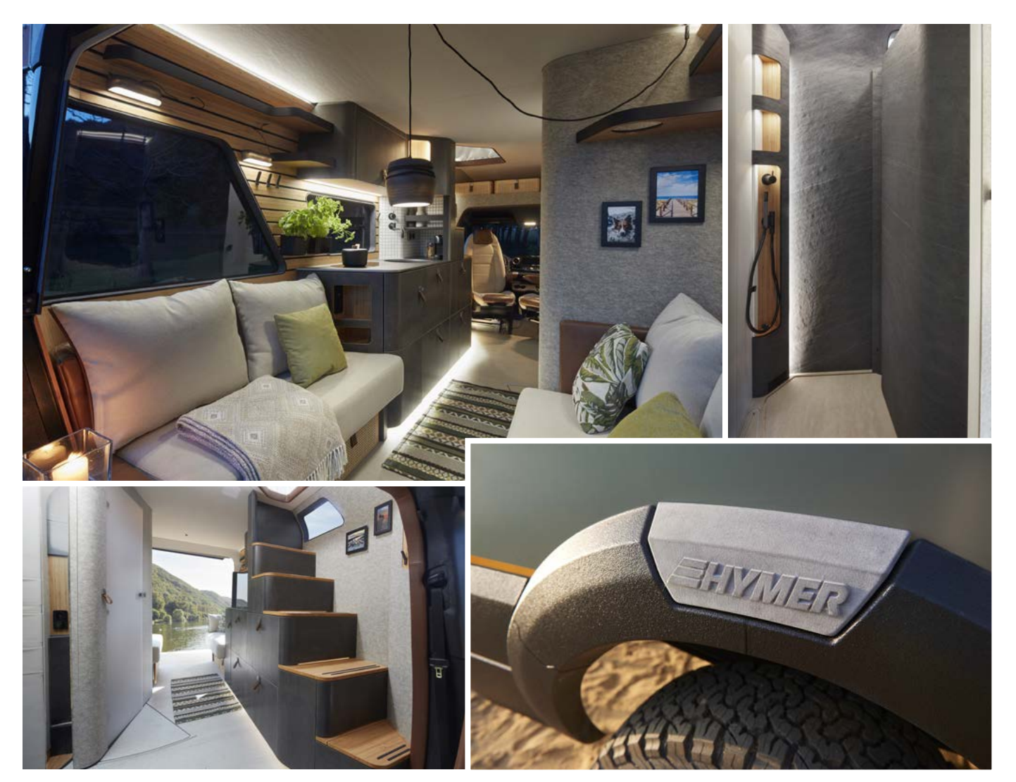
Many of the camper's living areas are multifunctional, including a wet/dry bathroom and a living room that can double as an office. (top-left) Hymer applied BASF's Veneo Slate, a pliable surfacing material with razor-thin, natural-stone facing, to the camper's bathroom walls. (top-right) Using many "tiny home" concepts, the van offers storage underneath the LED-illuminated staircase. (bottom-left) The vehicle includes more than 100 3D-printed components, including this wheel-arch cladding. (bottom-right)