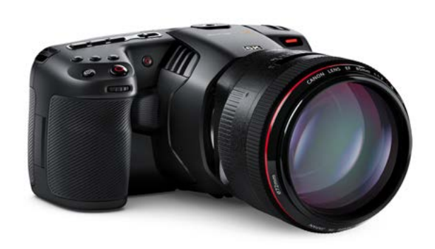
Australia's Blackmagic Design uses a carbon fiber composite body to make this 6K digital cinema camera ultra-lightweight.

Blackmagic Design, a digital cinema company and manufacturer in Port Melbourne, Australia, says its latest offering, the Pocket Cinema Camera 6K, is the world's lightest and most affordable professional 6K digital film camera. It is designed for independent filmmakers, TV, and web broadcasters.