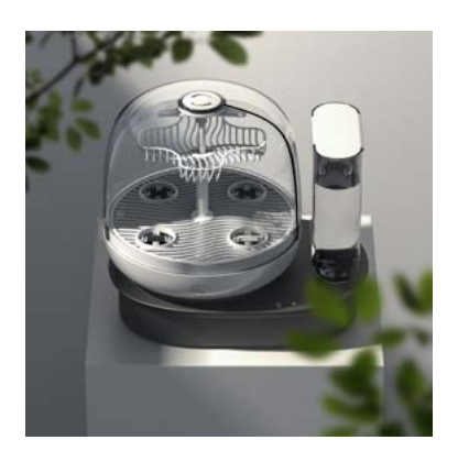
Bottle Bath washes, sterilizes, and dries baby bottles and related accessories in one step at the touch of a button.

The designers of Bottle Bath say they created it with the of goal helpina make parenting life easier. This three-inone device washes, sterilizes, and baby bottles and related accessories with the touch of a button. Parents no hand-wash longer bottles, sterilize them, and let them airdry. Bottle Bath does all three in a single process, in less than an hour, that saves water as compared with handwashing.