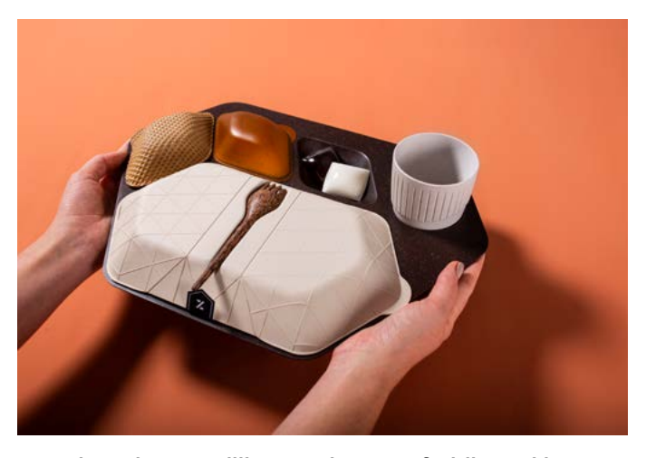
To reduce the 5.7 million metric tons of airline cabin waste generated each year, U.K. design firm PriestmanGoode used ecofriendly materials to replace single-use plastic for food-service sets.

One concept product that takes sustainability seriously is the zero-economy meal tray for airline use, by London design firm PriestmanGoode. Each year, the firm notes, an estimated 5.7 million metric tons of cabin waste is generated on passenger flights around the world. And the infrastructure is often lacking, especially on international flights, to recycle the single-use plastic waste involved.