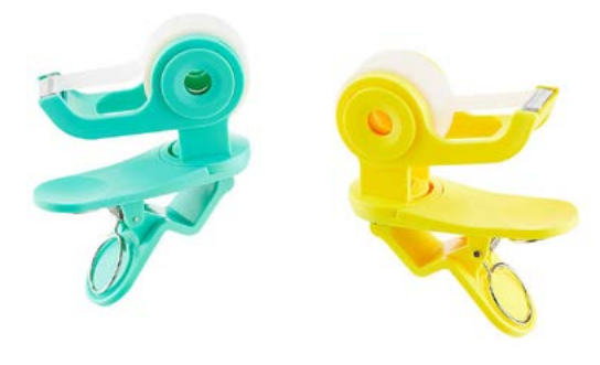
3M Co. aims to reinvent the basic Scotch tape dispenser with this form factor that clips to vertical or horizontal surfaces.

3M Co. developed a new type of tape dispenser called Clip & Twist that it says can "go anywhere, clip to anything, and quickly transform any area into a space for doing projects." The aim was to create a more compact tape dispenser that could be stored off a desktop.