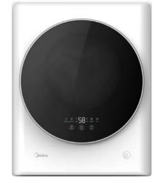
Wuxi Little Swan Electric Co. says its Midea wall-mounted mini washing machine can change laundry habits.

Designed by Wuxi Little Swan Electric Co. Ltd., the Midea wall-mounted mini washing machine features a clean and concise design to match the young image of Midea, a home appliance giant in China. The product is designed to be the