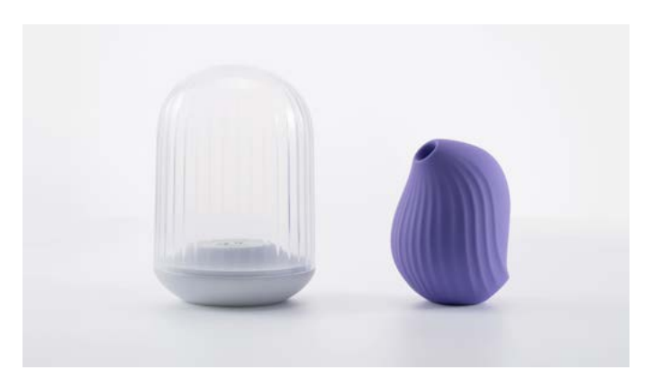
This soft, unintimidating Cuddly Bird vibrator is designed to help Asian women claim more control over their sexuality.

The double-stimulating Cuddly Bird combines the two functions of clitoris massager and vibrator in one compact size. The waterproof device uses both ABS and a two-shot, food-grade silicone, and comes with a