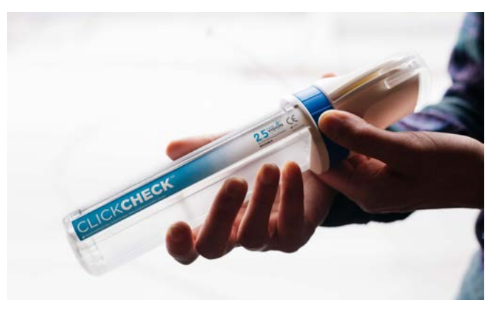
TEAMS Design's ClickCheck, using mostly ABS, PC, and acrylic, offers an affordable vision-screening system for developing countries.

The small, telescope-shaped device is injection molded from polycarbonate (PC) and acrylonitrile butadiene styrene (ABS) and has a couple of components of acrylic. "The choice of plastics played a huge role in our design because their properties are integral to many of the functions," explains Paul Hatch, a partner at TEAMS Chicago.