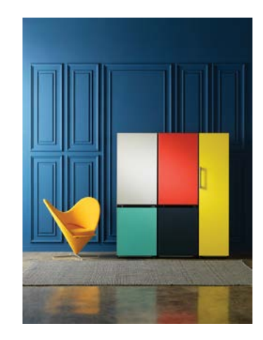
Samsung won Best in Show for its colorful, modular, customizable refrigerator lineup and interactive Family Hub UX touchscreen.

Samsung's Digital Appliances Design Team earned top honors in the contest for its BESPOKE line of modular, colorful, customizable and refrigerators. which also incorporate userfriendly interaction via its Family Hub UX highdefinition touchscreen mounted on the door. The lineup consists of versions. seven one-door to four-door models, that the user can mix and match, allowing consumers to grow or shrink the refrigeration space they need. Housed in an aluminum frame, the brightly colored external panels are glass,