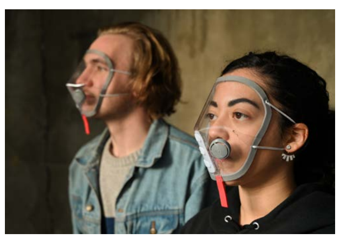
A student team at Virginia Tech developed this foldable T.E.A.R. Mask to protect peaceful protesters from tear gas.

A four-member team from the School of Architecture and Design at Virginia Polytechnic Institute and State University developed a design concept they call the Temporary Ear and Respiratory (T.E.A.R.) Mask that covers the wearer's eyes, nose, and mouth. It is designed to protect individuals from tear gas, and hence their right to peaceful protest.