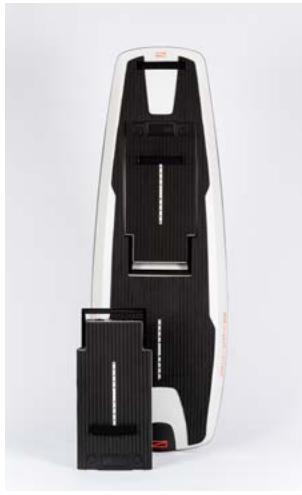
The Awake RÄVIK electric surfboard from Sweden incorporates carbon fiber for light weight, strength, and beauty.

competition, among them a Bird Two electric scooter, Dart electric ride-share bike, and a portfolio of six EV concepts by BRP Inc. aimed at demonstrating the viability of electric power in non-traditional applications such as powersports vehicles. BRP, based in Valcourt, Quebec, makes recreational products such as Ski-Doo snowmobiles, Sea-Doo watercraft, and all-terrain vehicles. Sony Corp. even earned a Silver award for its Vision-S prototype electric sedan. But perhaps the most unusual use of electric power came from Sweden's Ride Awake AB, with its Awake RÄVIK electric surfboard. The company says it is built for use by novices and extreme sports enthusiasts alike. "Powered by a patent-pending drive system, the RÄVIK is propelled through any water and over waves with unparalleled efficiency," it claims, and is able to go from zero to 31 mph in just four seconds, with a top speed of nearly 35 mph (30 knots). RÄVIK's unique throttle comes with its own induction charger.