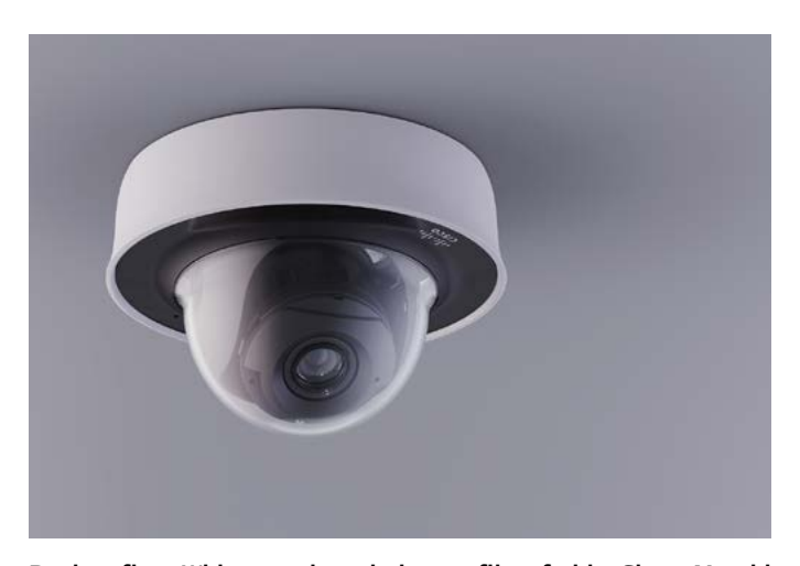
Design firm Whipsaw altered the profile of this Cisco Meraki commercial security camera to make it more elegant and less industrial.

Though public security cameras are ubiquitous, they are often poorly designed and intimidating eyesores, notes design firm Whipsaw Inc. of San Jose, Calif. Its client, Cisco Meraki, wanted an elegant and "friendly" line of smart cameras for enterprise use. "We flipped the standard security camera form by designing a lowprofile bowl shape," Whipsaw explains