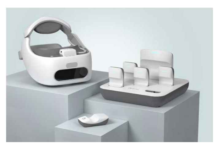
The REAL Immersive System designed by Delve is a simple, portable rehabilitation tool to help stroke patients.

More than 3.3 percent of Americans live with the consequences of stroke, which often seriously impairs motor and cognitive skills. Studies show virtual reality (VR) could be a valuable tool in helping to rewire neural pathways, but no one has commercialized a hardware/ software product solution tailored to the needs of rehab patients with a low-cost/at-scale product. The REAL Immersive System has been developed for such needs, according to those who conceived it.