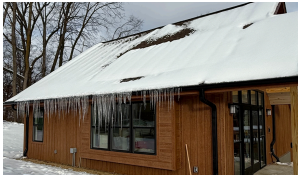
Welcome Center Naming Rights $300,000