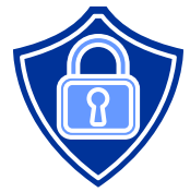
Security System Team 3 donors each $3,000