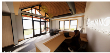
Reception and Visitor Lobby $50,000