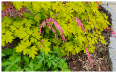
Welcome Center Landscaping $250 to $25,000