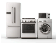
Stainless Steel Appliances $5,000