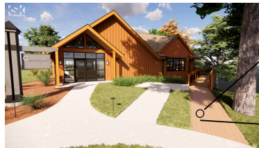
Facility Steward $25,000