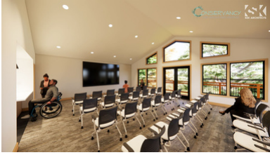
Multipurpose Room $150,000