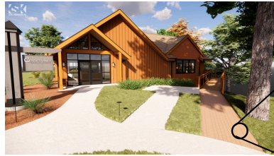
Annual Maintenance Partner $25,000