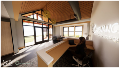
Reception and Visitor Lobby $50,000