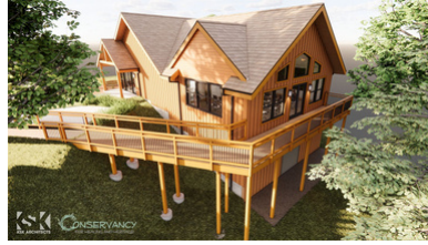
Woodland Observation Deck $75,000