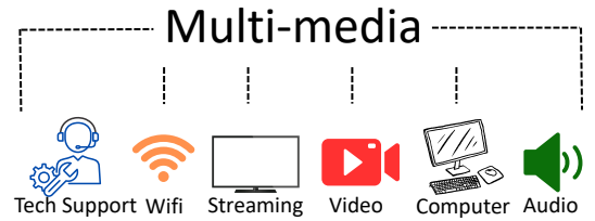
Multi-media System $15,000