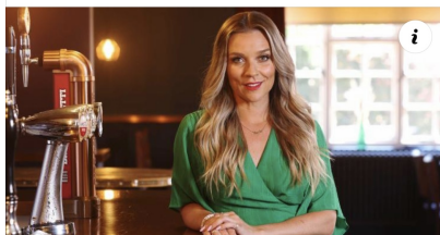
morningadvertiser.co.uk First Green Pub Guide launched

"I'm delighted to be working with SmartDispense to launch the very first Green Pub Guide, celebrating innovative and inspired initiatives across the country."