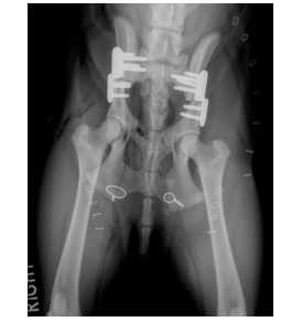
Figure 3: Ventro-dorsal projection of bilateral TPC

Patients were diagnosed with hip dysplasia based on clinical signs, orthopedic examination, and diagnostic imaging (computed tomography [CT], plain film radiography, or both). Coxofemoral joint arthritis was evaluated with arthroscopy before the TPO. Patients were followed for a minimum of 12 weeks with orthopedic exams, visual gait analysis, and plain film radiographs. Eleven dogs had TPOs (15) utilizing pre-angled 20° LTPO plates. Six patients had bilateral TPO performed bilaterally with 2 LTPO plates and 2 patients had bilateral TPO with one locking and one conventional plate. The plates were secured with conventional 3.5 mm compression screws and 3.5 mm locking screws at positions that varied according to surgeon preference. The patients were followed for 19-88 days after surgery. Radiographs were performed at 3, 6, and 12 weeks after surgery or if clinical evidence of complications (Figure 3 and 4). Complications were treated with additional surgery when required. Healing of the TPO was determined by clinical appearance, physical examination, and radiographic evidence.