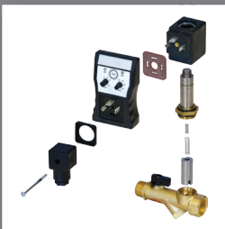
Easily serviceable valve