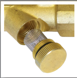
Integrated mesh strainer