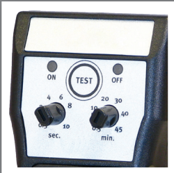
LED lights & test function