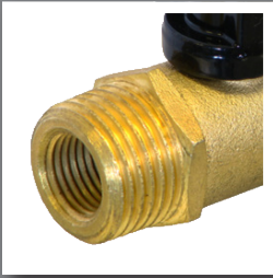
Dual threaded inlet port