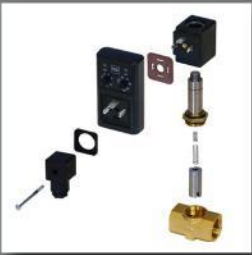
Fully serviceable valve