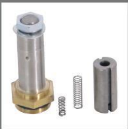
Inexpensive service kit