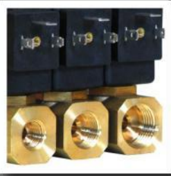
Multiple connection sizes