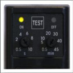
LED lights & test function