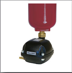
Compact modern design