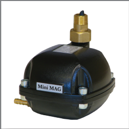
Rugged aluminum housing