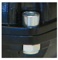
Easy maintenance access