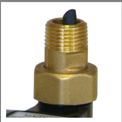
Built in air lock prevention