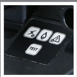
LED lights & test button