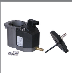
Removable top cover