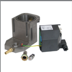
Easy to service