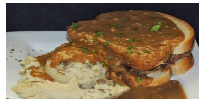
Thursday hot turkey sandwich