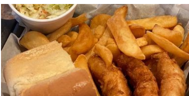
Friday fish fry