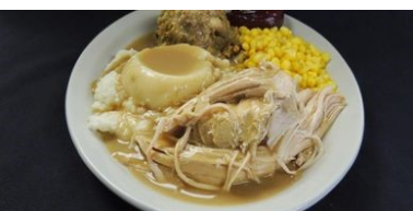
Sunday turkey dinner