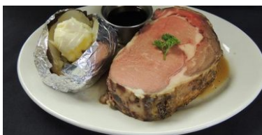
Saturday prime rib