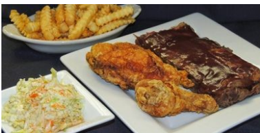
Wednesday ribs and chicken

Hot Turkey Open-faced Sandwich Served with mashed potatoes and gravy. $10.99