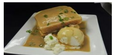
Sunday turkey sandwich