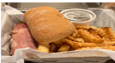
Nightly prime rib sandwich