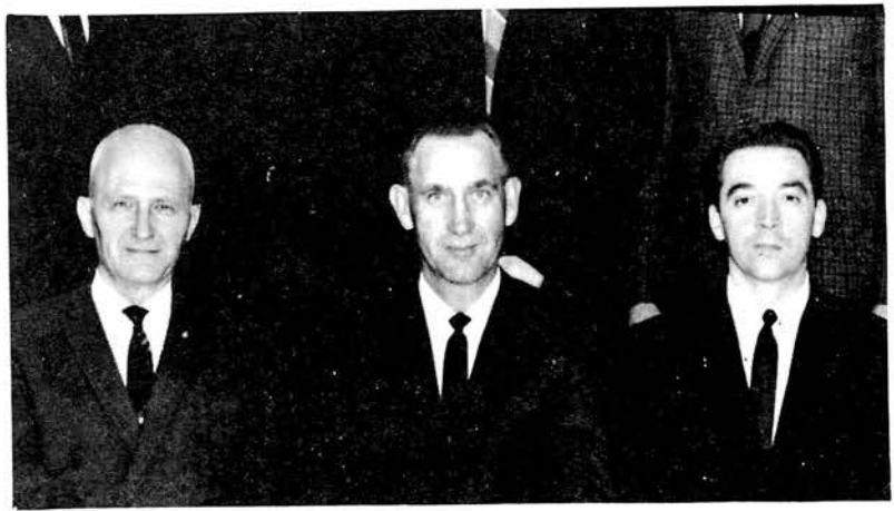
FORMER BOUNTIFUL SOUTH STAKE PRESIDENCY

It is with love and gratitude that members of the two wards and the Bountiful South Stake gather together today to see this edifice dedicated to the Lord and his purposes.