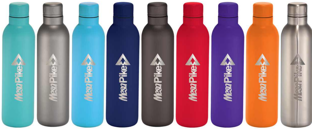
Vacuum Insulated Bottles