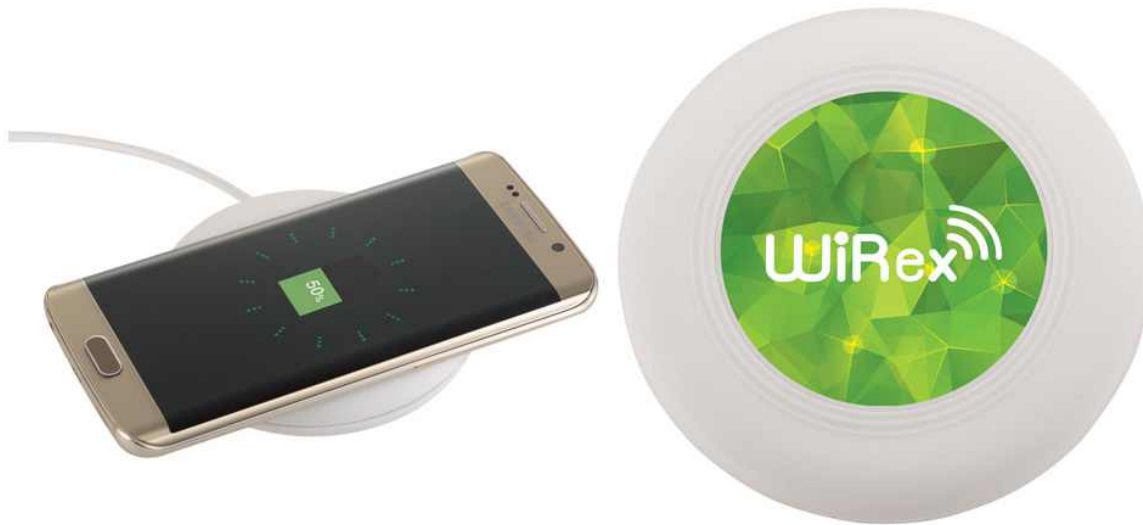
Wireless Charging Pads