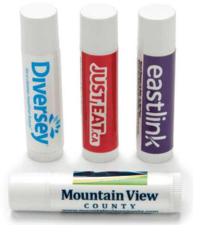
Natural Beeswax Lip Balm