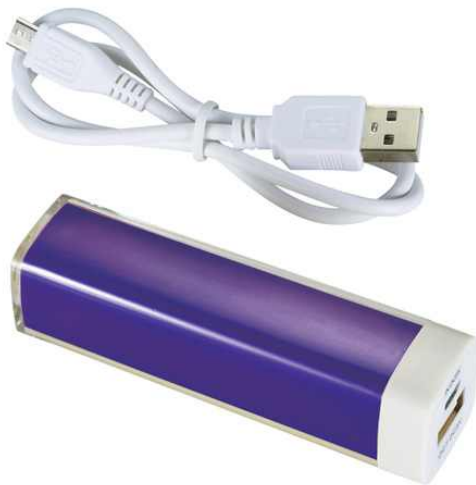
Rechargeable Power Banks