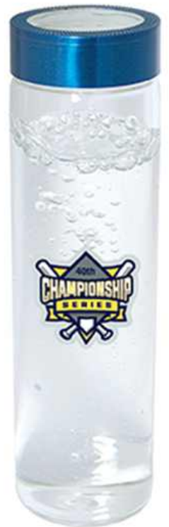
Glass Water Bottles