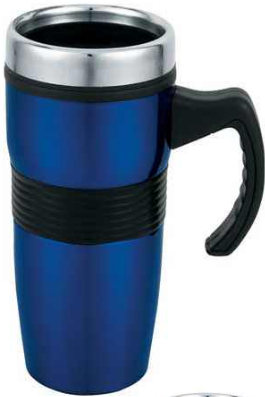
Stainless Travel Mugs