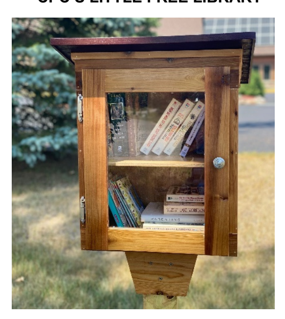
We Need More Books!

Do you have books on your shelves (or hiding in storage boxes) that you enjoyed reading but are unlikely to read again? We have an opportunity for you to share those books with others.