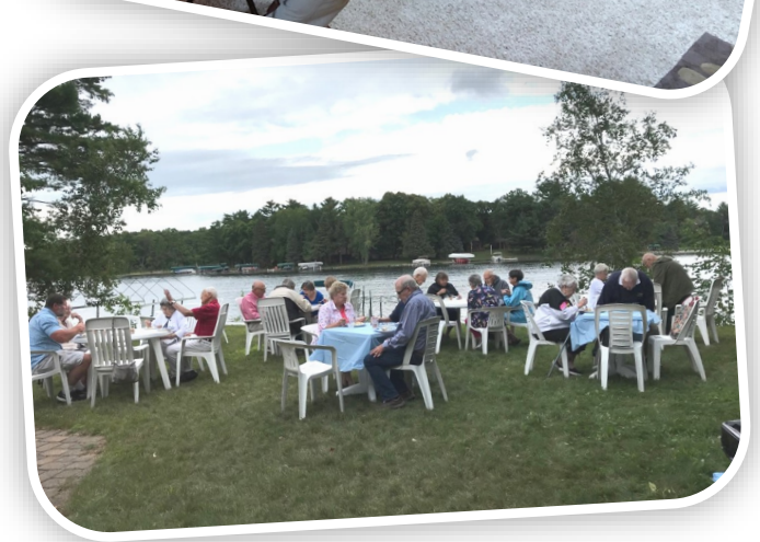
FOLLOWED BY FAJITA'S AT THE KOHL'S...