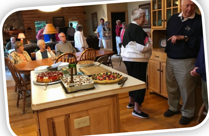
& DESSERT AT JACK & JANE'S!