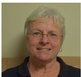
Gwen Sand Amplified Telephone Distribution