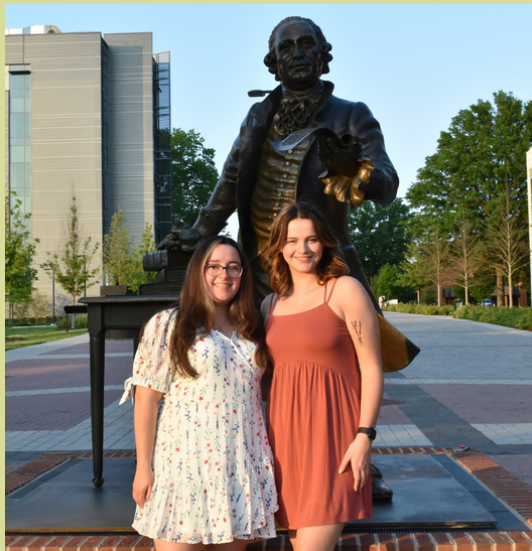
OUR RECRUITMENT TEAM!

The Panhellenic Council is the governing body for Panhellenic sorority life on campus. The council is composed of representatives from the seven sororities that are affiliated with the National Panhellenic Conference (NPC). Although our sisters wear different letters, we are united by our values, which are academic excellence, community service, and leadership development.