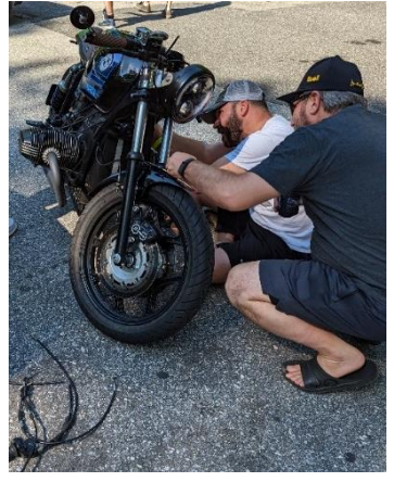
Cables take no prisoners