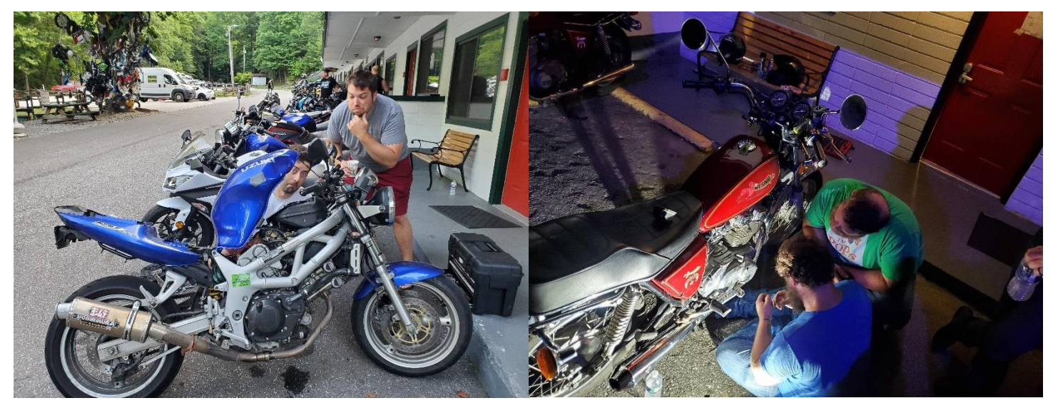
Last minute tweaks or desperate measures? We find out Saturday morning!

A welcome cookout greets the Reliable Riders Friday evening, coming in from all corners of the Eastern US. An obligatory rev or two after unloading only adds to the fun atmosphere. The rules are simple, buy a bike for $1000 or less, fix it up, and wheel it out to take on our 400 mile touring weekend. Always motley, always interesting, the field includes barely running survivors, completely mint custom builds, and everything in between. Some riders had a little buttoning up to do while we chowed down hotdogs, wings and cheap beer.