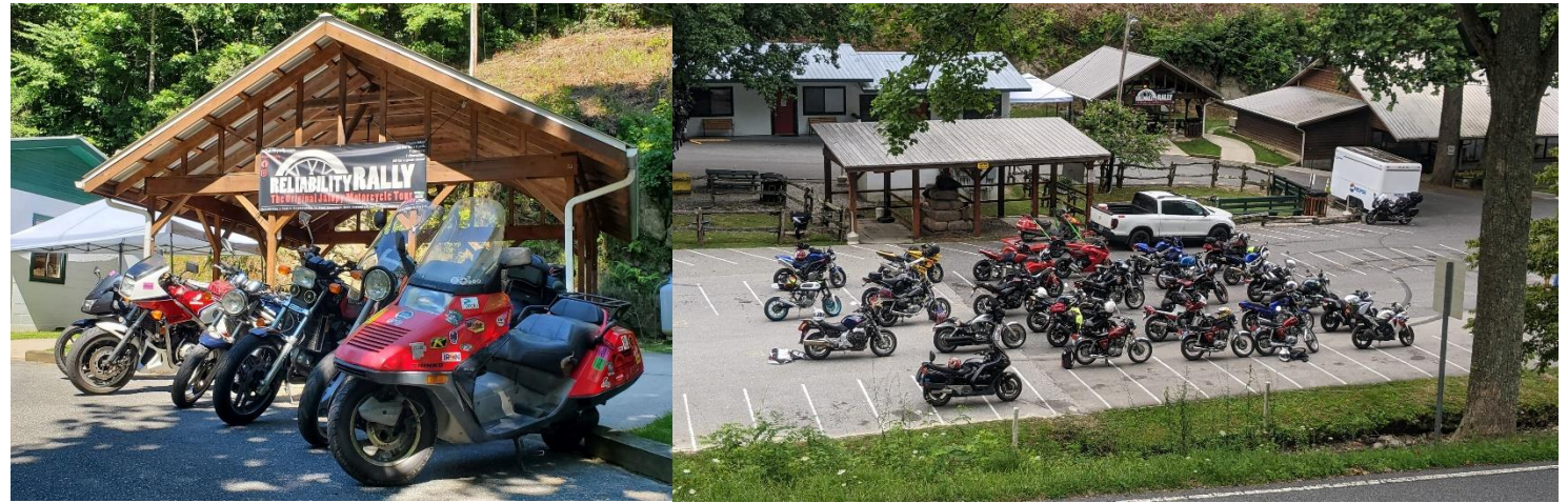
Some of the bikes are 10 footers, the rest are 20 footers. All of them were purchased for $1000 or less.

Deal's Gap, North Carolina is home to some of the most hallowed pavement on the planet. The world famous Dragon throws 318 corners at you in a scant 11 miles. The challenge is relentless and thrills unmatched. Typical Dragon slayers fancy all sorts of high performance exotica, both two wheeled and four. Except for one weekend in July when Reliability Rally rolls in to town.