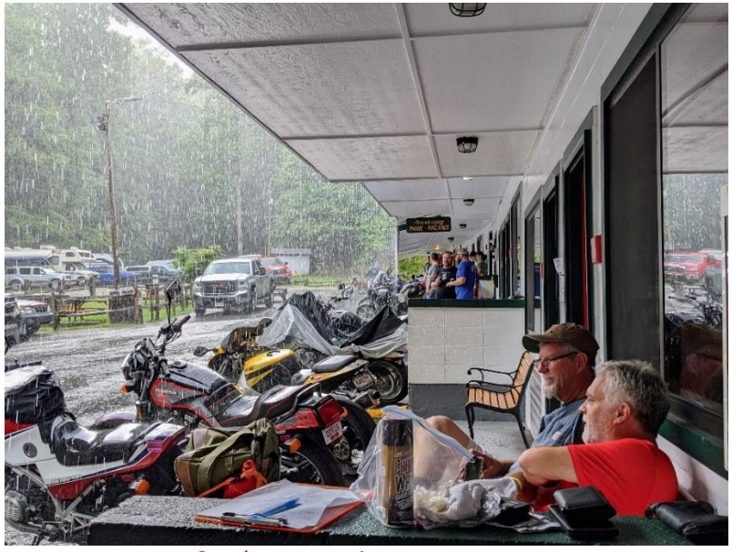
Smoky mountain summer storms

Misery always rears its head at some point during the RR. Early afternoon on Sunday the skies opened, causing a quick scramble for rain gear and fresh determination to press on. There was one final on-road contest to be completed, the fuel economy run. All riders topped up their tanks for a soggy cruise back to RR HQ.