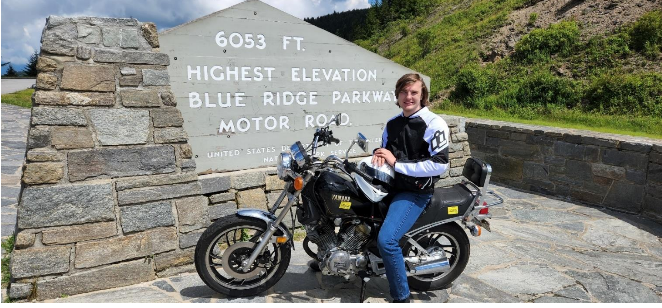
Found the top!

Sunday, ride day 2. The ride groups are beginning to gel, just in time because Sunday's ride has serious miles to cover. After dodging the tourist traffic in Cherokee, we began to climb, setting our sights on the peak of the Blue Ridge Parkway. After a quick snack and some photos, it was time to seek out some more twisty roads.