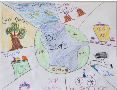
Rosalee Green 8th Grade