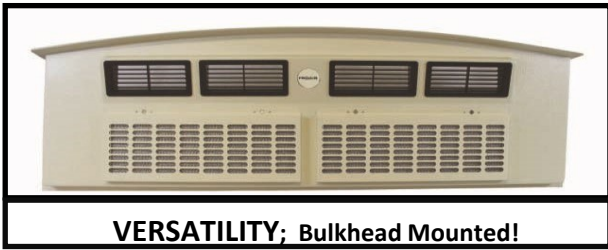
VERSATILITY; Bulkhead Mounted!