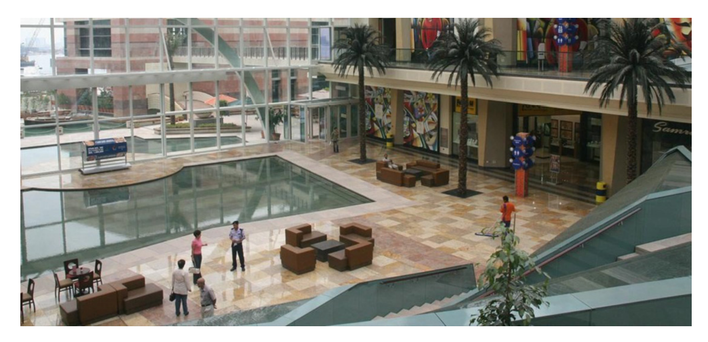
Figure 3. The rest area in Dubai Festival City (source: by the authors).

To achieve this, this study used literature and empirical studies to analyze the characteristics of rest areas located inside and outside shopping malls, and to evaluate user satisfaction [29]. Firstly, a literature review was conducted to investigate the concept, function and role, classification, components, and characteristics of the rest area in shopping malls. Then, by setting the attributes of the rest area, evaluation factors and detailed evaluation contents were extracted and specified so that the characteristics of each indoor and outdoor rest area could be evaluated [30,31].