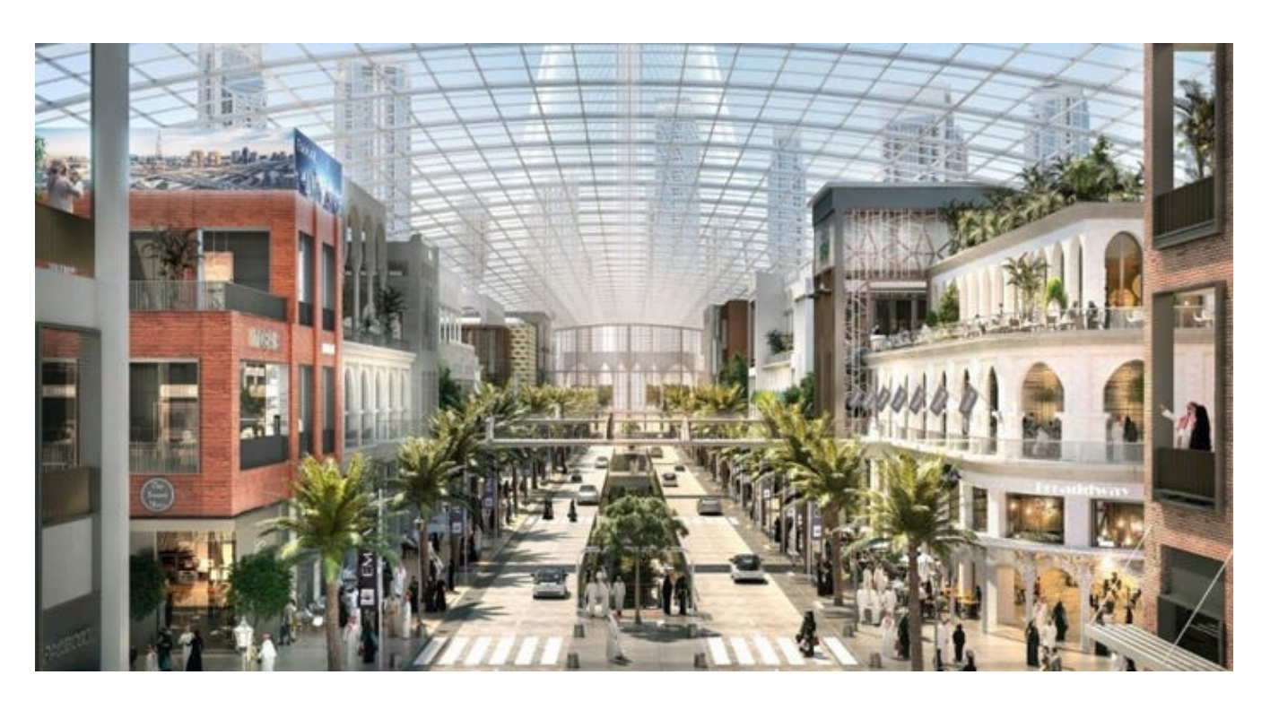
Figure 1. "The Boulevard" at Dubai Square, currently under construction.