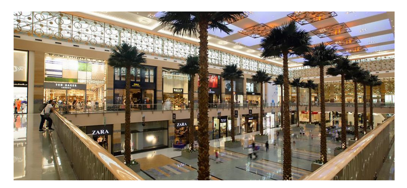
Figure 8. The open-corridor rest area in Mirdif City Center (source: by the authors).

S.D. (standard deviation), ** p < 0.01, *** p < 0.001.