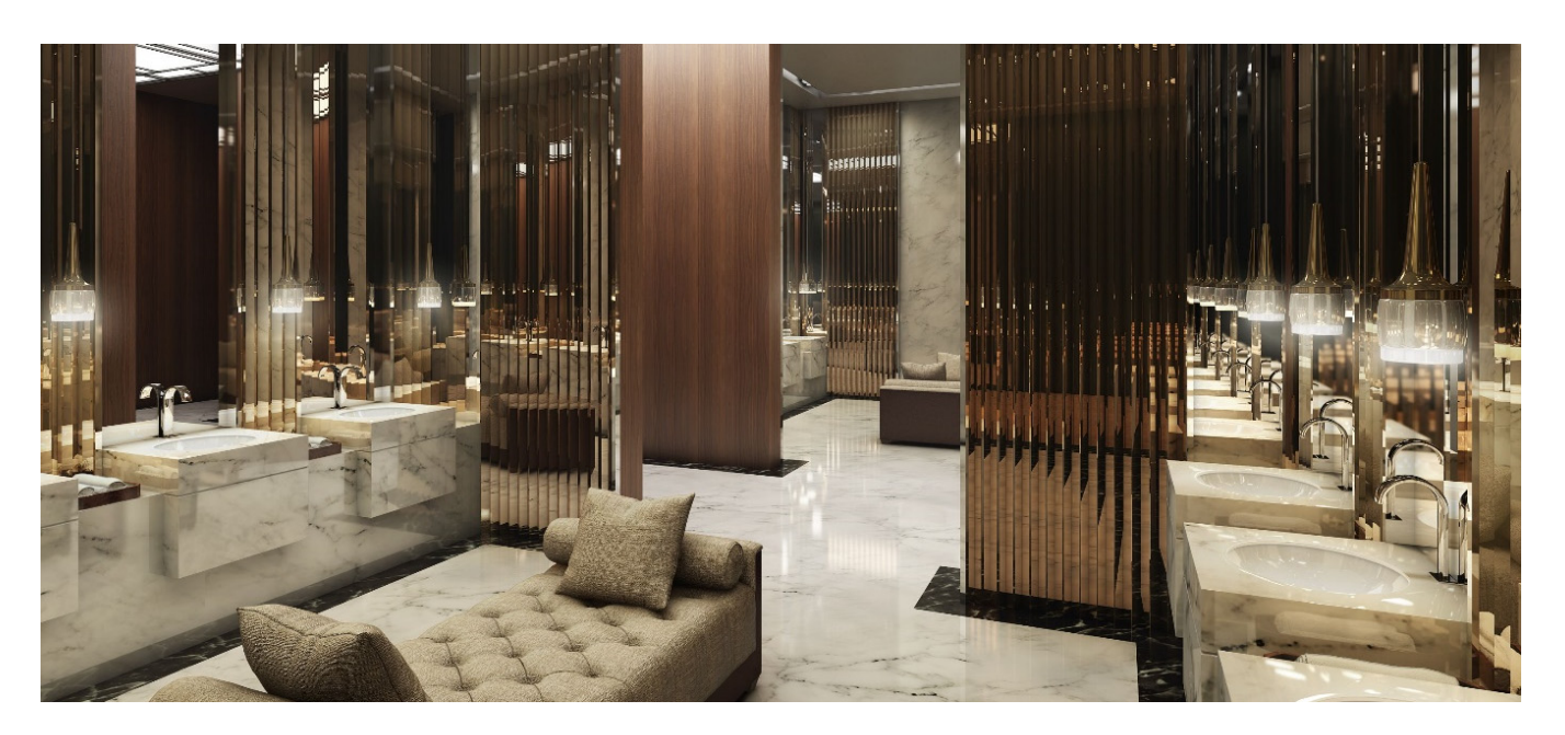
Figure 7. The rest area next to the bathroom in Dubai Mall.

Regarding accessibility, the item for easy access by users (BAC-3) received the highest rating, while the item for protecting users' privacy during personal rest time received the lowest. Overall, BAC-2, the easy-access item, received an above-average rating with no significant difference. However, in the BAC-1 item, which evaluates privacy, Dubai Mall received the highest rating, whereas Mirdif City Center received the lowest, showing a significant difference (p < 0.001). Rest areas were situated in some restrooms in relatively narrow spaces in Dubai Festival City and Mirdif City Center. In contrast, Dubai Mall received higher ratings by providing separate rest areas.