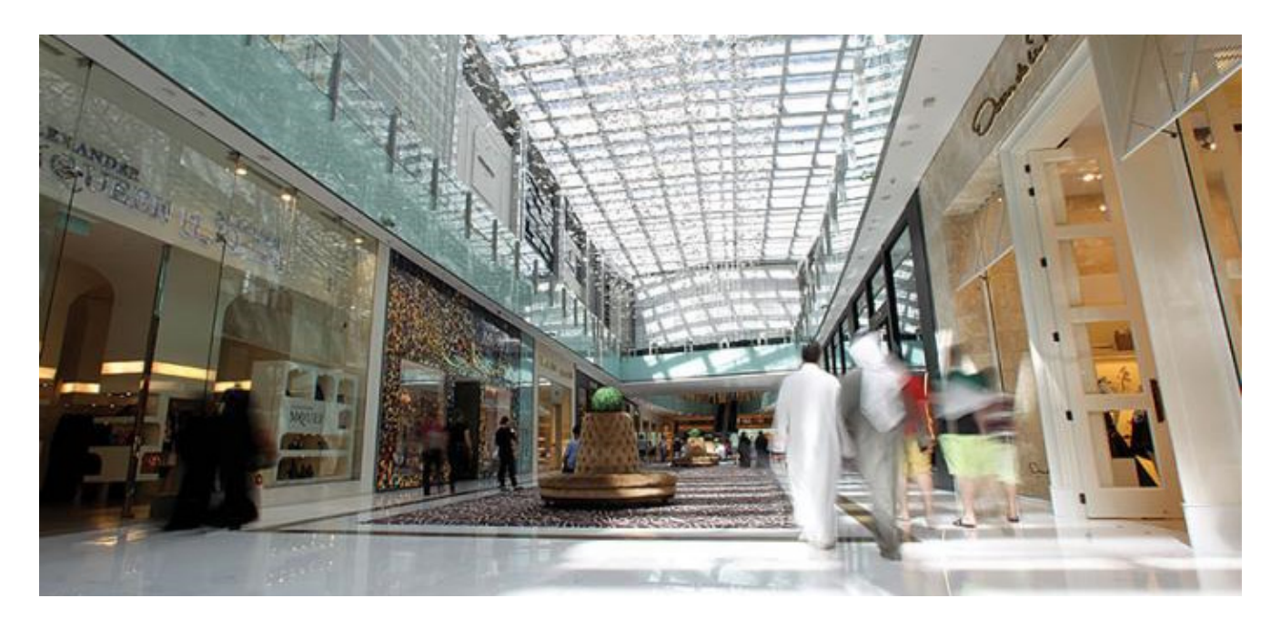
Figure 2. The rest area in Dubai Mall.