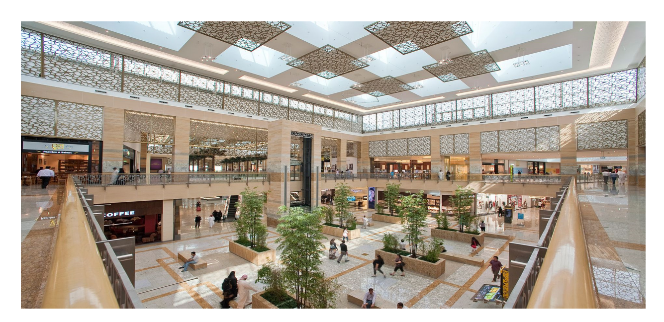
Figure 4. The rest area in Mirdif City Center.

Secondly, in the empirical study, field and user-satisfaction surveys investigated the status of the shopping mall's rest area. The empirical research scope focused on a shopping mall with indoor and outdoor rest areas. Three shopping malls that opened within the past 10 years—Dubai Mall, Dubai Festival City, and Mirdif City Center—were selected as examples [32].