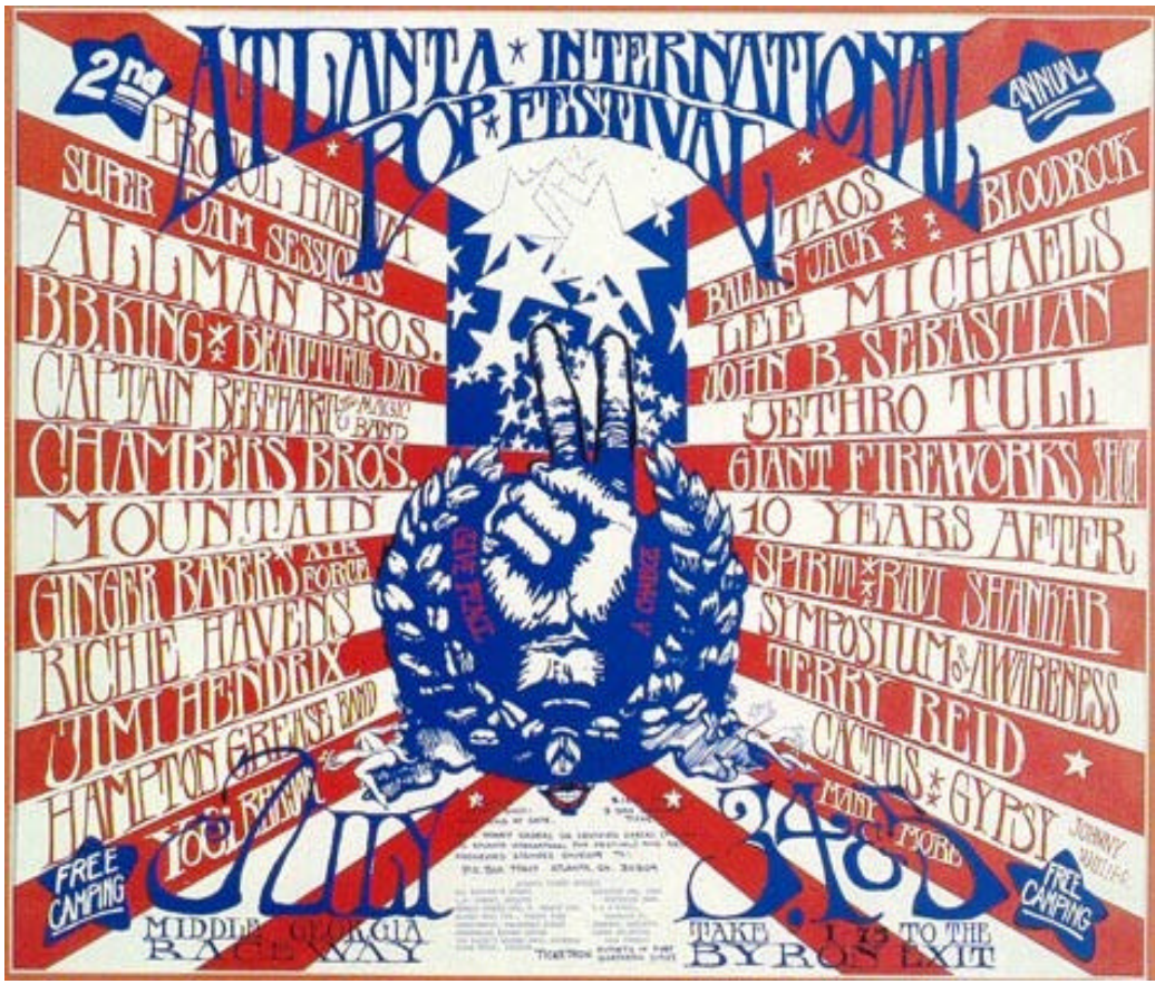
Allman Brothers Band 7/3/70 Atlanta Pop Fest.