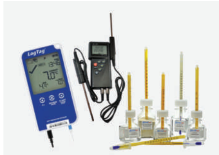
LogTag products (left) and Thermco Products offered.