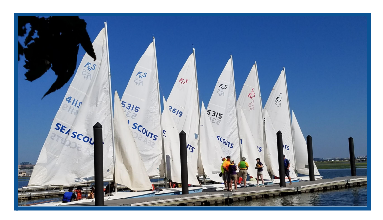
Looking forward to seeing you on March 6th, 2021!