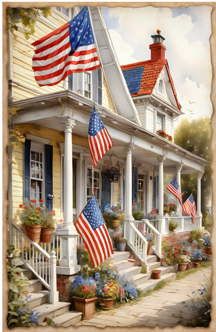
Gotta love a Summer porch, right?

Click HERE to link directly to full board minutes and all financial reports and HOA forms, now at www.southcoastshores.info/