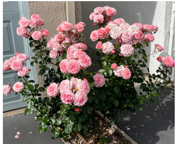
The most beautiful homeowner-planted roses within a garagecourt noticed this month!

Trees planted without prior authorization and which result in property damage shall be the responsibility of the homeowner and any repairs and removal must be paid for by the homeowner. Fruit trees are no longer allowed to be planted in the common areas. Let us know if you have any questions, contact info at top of article.