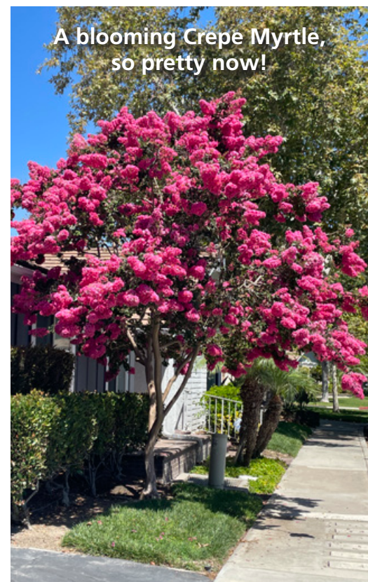
A blooming Crepe Myrtle, so pretty now!