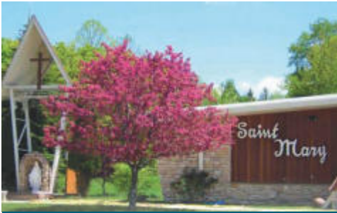
St. Mary of Phelps