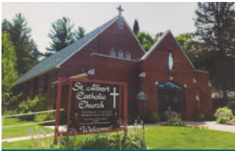
St. Albert of Land O' Lakes