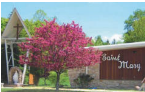
St. Mary of Phelps