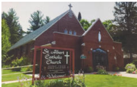
St. Albert of Land O' Lakes

Tue.-Thurs.: 8 am - 4 pm | Fri: 8 am - Noon