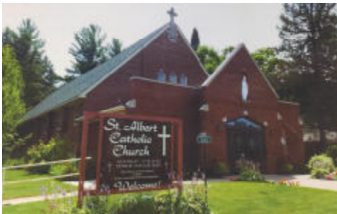
St. Albert of Land O' Lakes

Tue.-Thurs.: 8 am - 4 pm | Fri: 8 am - Noon