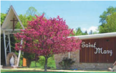
St. Mary of Phelps