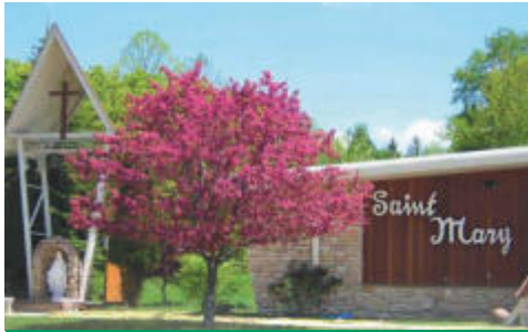
St. Mary of Phelps