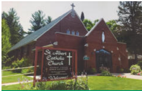
St. Albert of Land O' Lakes

Tue.-Thurs.: 8 am - 4 pm | Fri: 8 am - Noon